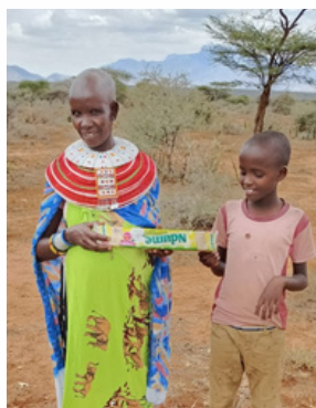
TWO STUDENTS FROM WAMBA SHARING THEIR CHRISTMAS GIFTS WITH FAMILY MEMBERS