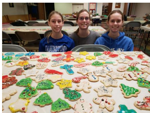
The youth frosted 240 cookies for the cookie walk. They raised over $400.

Thank you for all those excellent bakers who donated cookies for our cookie walk.